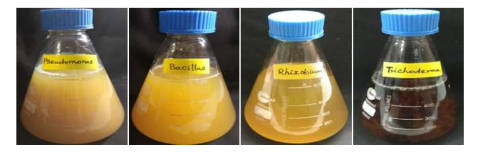
Figure 1. Mass production of microorganisms

1). The viability count of biofertilizer organisms in stored carrier material was individually carried out once in 15 days for a total period of ten months. The colony forming unit (CFU) more than 1.7 \times 10^6 g<sup>-1</sup> viable cell of B. subtilis , 8.6 \times 10^6 g<sup>-1</sup> viable cell of P. fluorescens , 4.7 \times 10^6 g<sup>-1</sup> viable cell of Rhizobium and 2.4 \times 10^8 g<sup>-1</sup> propagates of Trichoderma were observed in 1:2 combinations of culture and carrier materials (Fig. 2). The effects of carrier material and storage temperature on the viable cell number, pH and moisture content of the biofertilizers are important because the functioning and reliability of the biofertilizer to increase crop yield may be affected by it. Thus, it is important to emphasis on proper method of storage and temperature in which will prolong the shelf-life of the biofertilizer. Selection of the proper type of carrier materials is also very important. It should be able to sustain a high amount of bacterial inoculants for as long as possible. A high number of bacteria present and the capability to sustain for a long period of time ensure that the biofertilizer is in good condition and is readily applied to the soil.