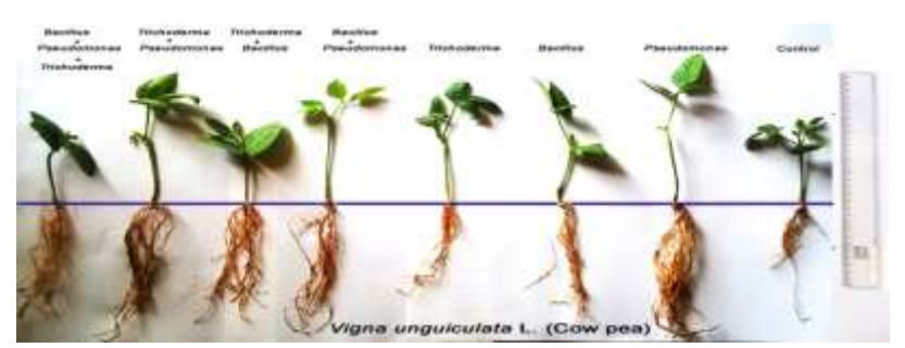
Figure 5. Effect of various microbial biofertilizers on treated and untreated (Control) cow pea plants (45 days treatment)