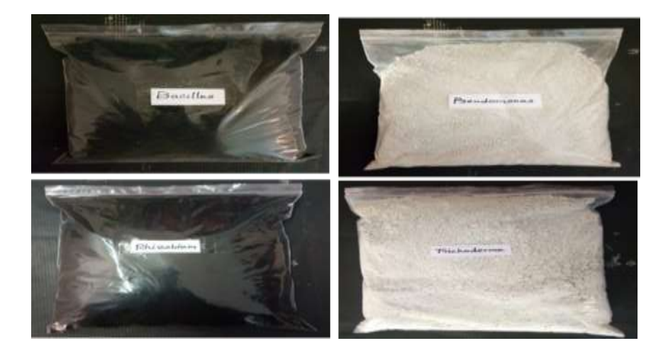
Figure 2. Preparation of microbial biofertilizer